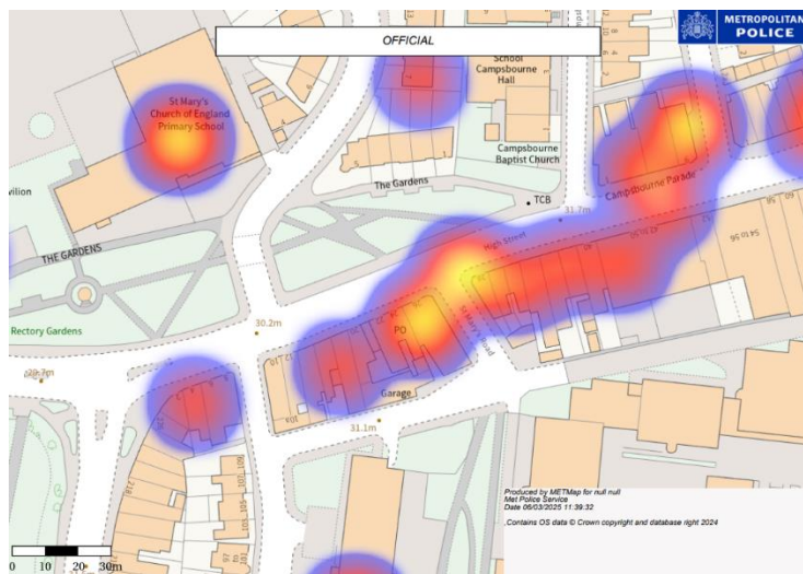
Violence against the person for the address and the immediate area. 05/03/2024- 06/03/2025.

The premises is presenting as a Police hotspot for Violence against the person, Criminal damage and Public order offences.